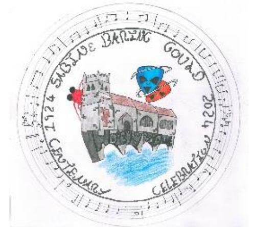
St Peter Lewtrenchard