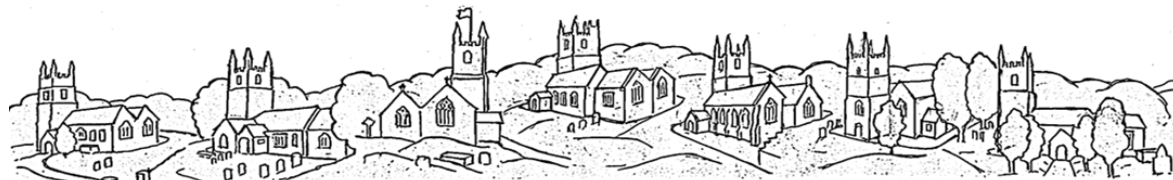
St Mary the Virgin, Kelly with Bradstone