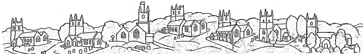
St Mary the Virgin, Kelly with Bradstone